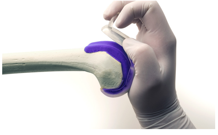
Allow the cement to cure completely, then remove the spacer mold.