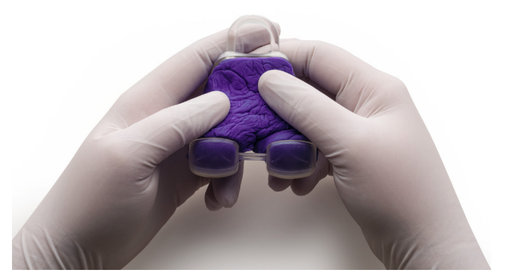
1. When the bone cement becomes doughy, and no longer sticks to surgical gloves, manually press the cement into the femoral mold.

Remove previously implanted components, residual bone cement, and clean the infected joint. Select the appropriate size femoral mold by comparing the explanted component to the dimensions of the femoral spacer mold. Mix two batches of bone cement to fill the mold.