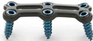
Envision® Cervical Plate