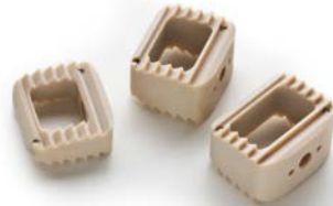
Vusion® CS Plus