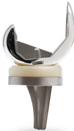
BKS TriMax® with E-Vitalize® Polyethylene