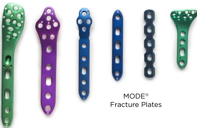
MODE® Fracture Plates

of plates and screws for the fragility fracture market along with compression hip screws.