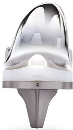
Balanced Knee® System